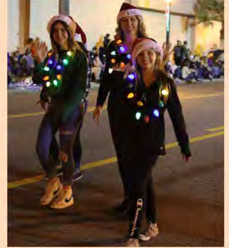
PHOTOS OF 2023 LAKELAND CHRISTMAS PARADE, COURTESY OF THE CITY OF LAKELAND.